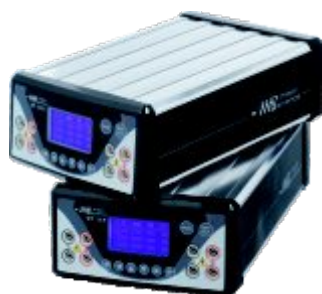
MP-500V & MP 3AP