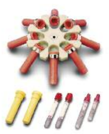
Swinging Bucket Rotor