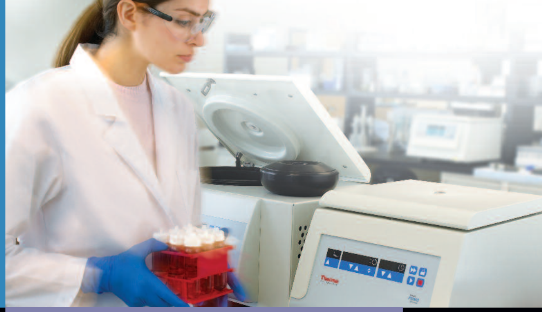
Flexible and efficient, compact high-performance centrifuges

Thermo Scientific Heraeus Primo and Primo R Centrifuges